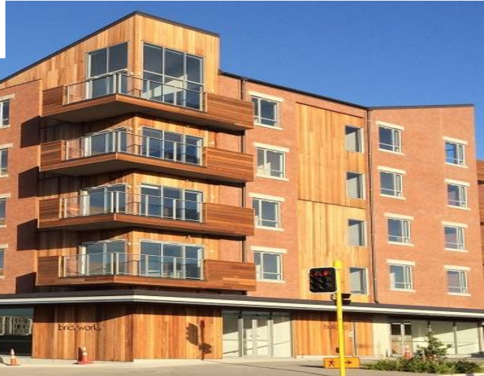
John Key visits Brickworks