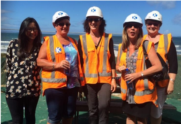
Kalmar Girls at Ocean Point Site Visit

The Ocean Point development is full-steam ahead on the final run to completion. Finishing the luxury apartments to the highest standard is the focus, and we've had excellent buy-in from sub-contractors and suppliers to achieve this goal in a timely fashion with a safe work environment being the key.