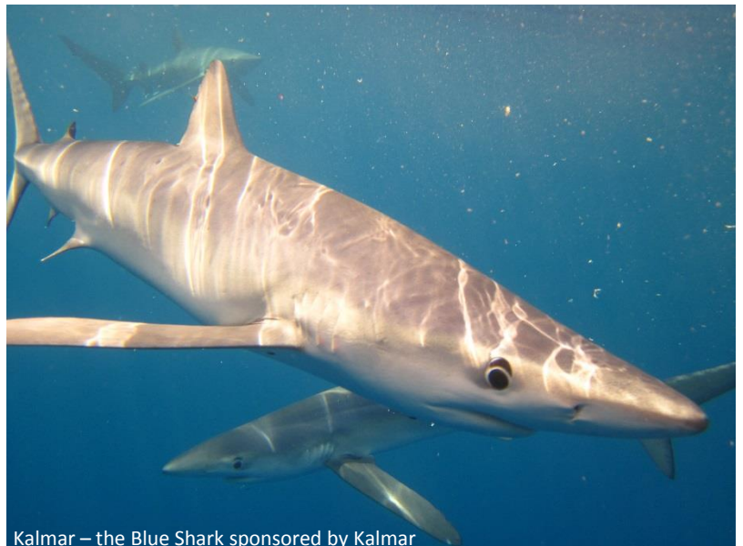
Kalmar – the Blue Shark sponsored by Kalmar