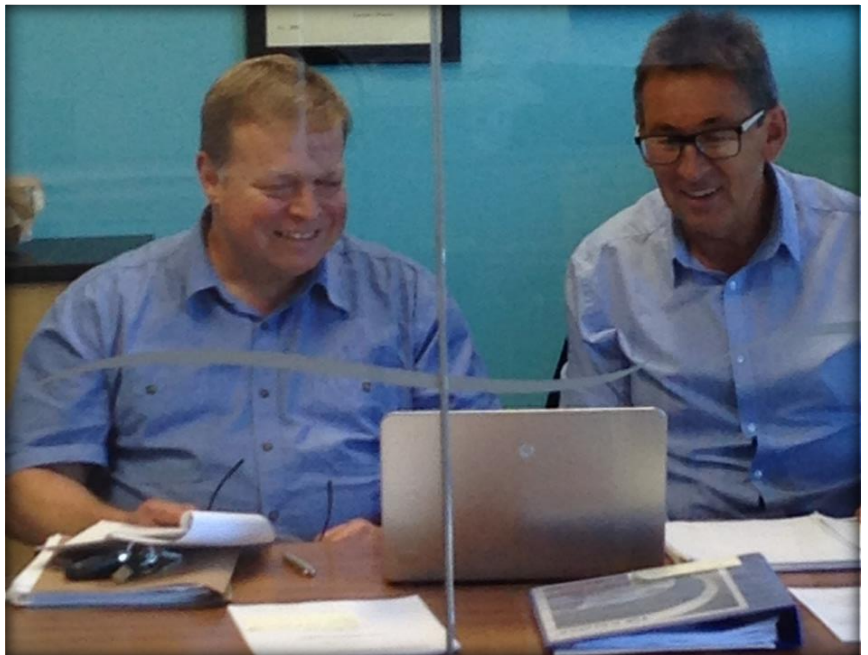
This has nothing to do with rugby....