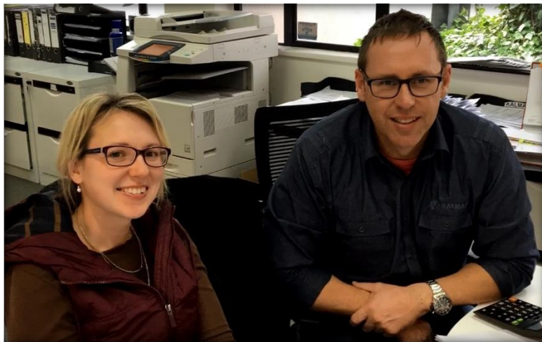
The Harbour "Brains Trust"