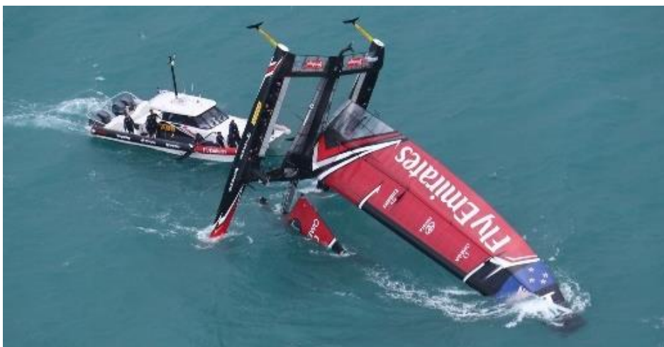
What a turnaround!

Coming up in the next couple of months - Drift Cars and Paintball.