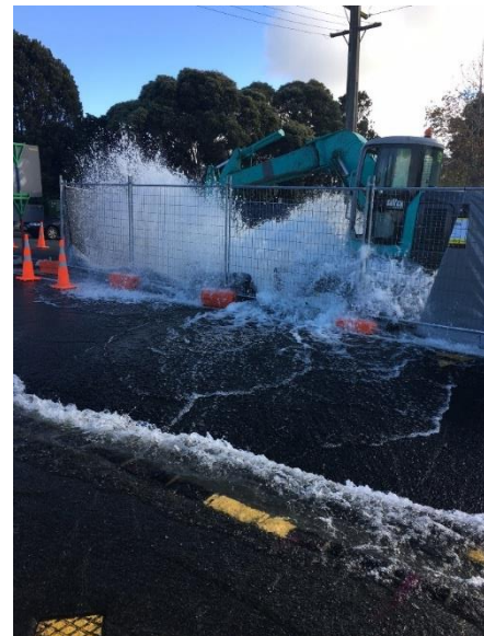
Someone found the watermain for us at the James - 11 th July 2017