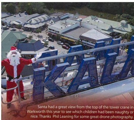
Santa had a great view from the top of the tower crane in Warkworth this year to see which children had been naughty or nice. Thanks Phil Leaning for some great drone photography.