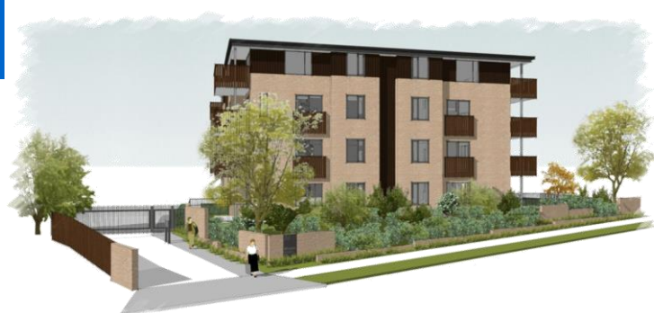
Bloom Manurewa Artist's Impression

Resource Consent has been received, but we are still waiting on Building Consent.