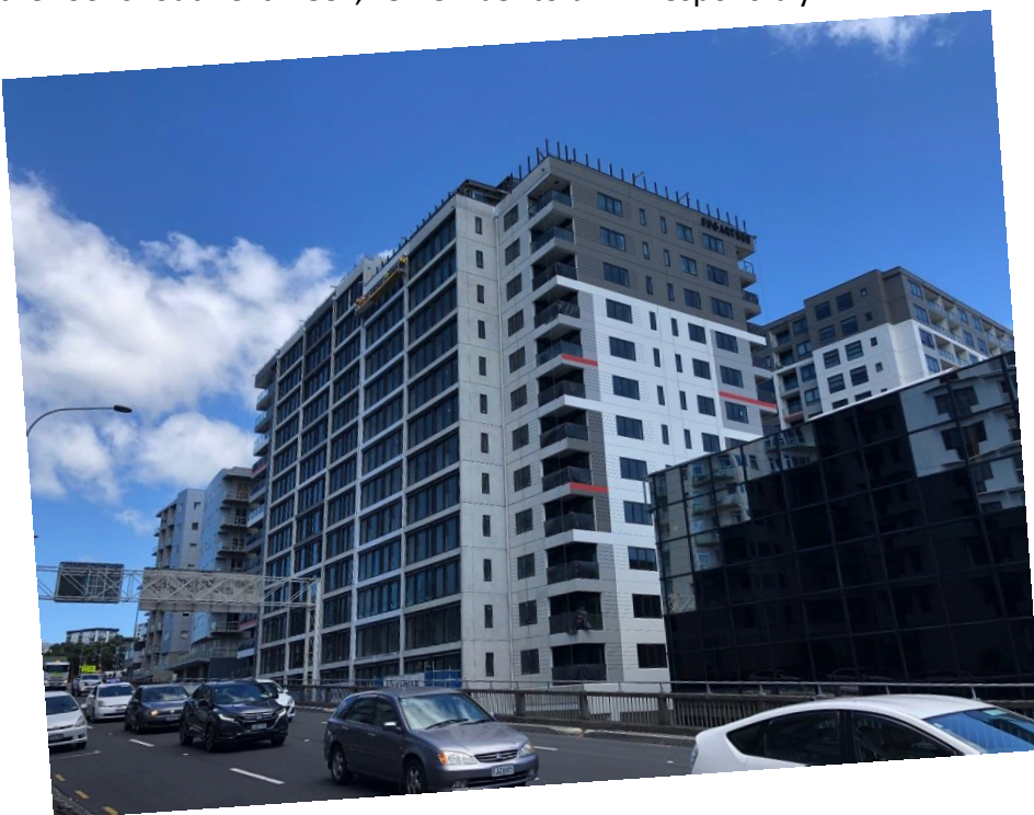
The Sugartree Team

See you all at the roof shout next week, remember to drink responsibly.